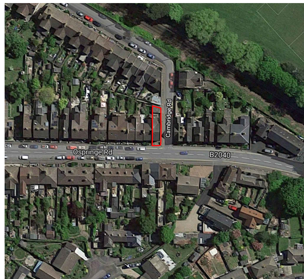
Aerial Location Plan